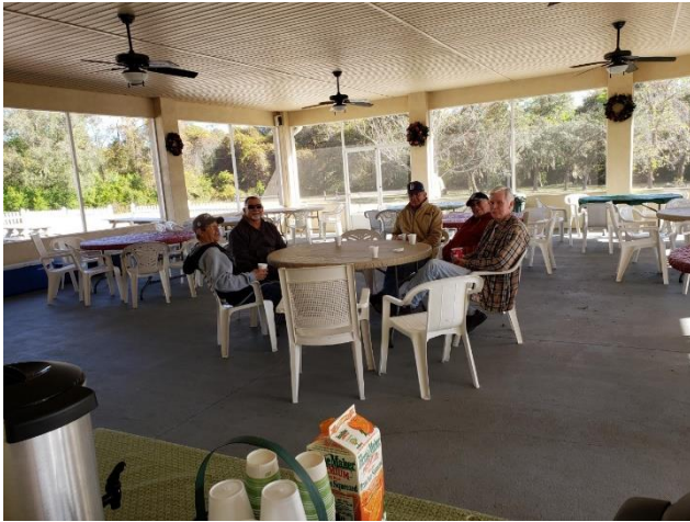
The first for morning coffee and pastries.