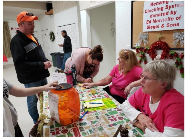
Getting tickets for the clock/or $1000 raffle.