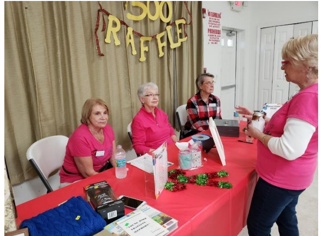
$500 Cash Raffle