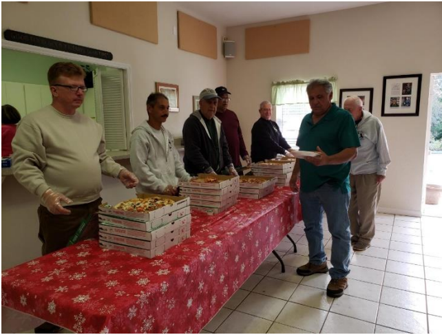
The men serve pizza before the auction.