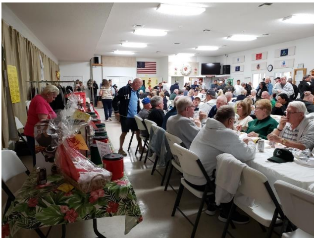
A nice crowd