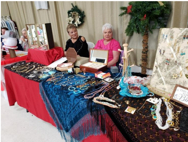
2nd Hand Rose