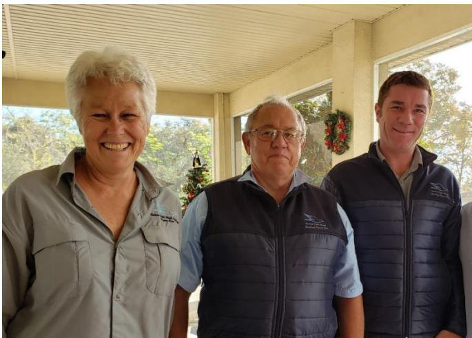
Our visitors from far, far away. Victoria Falls World Challenge Pigeon Race Zimbabwe, South Africa